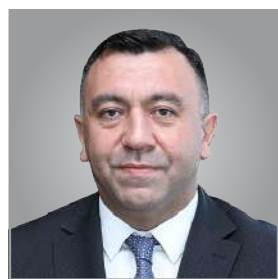
H.E. Mr. Samad Bashirli Deputy Minister of Economy of the Republic of Azerbaijan