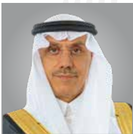
H.E. Dr. Muhammad Al Jasser